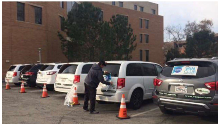
January 2019 - VanClub Decal Installation at University of California Riverside Campus

RCTC will continue to employ existing and new strategies to recruit and maintain additional vanpools and ensure program continuation. The program resulted in 624,749 unlinked passenger trips, eliminating 18.2 million miles and 6,872 tons of emissions.